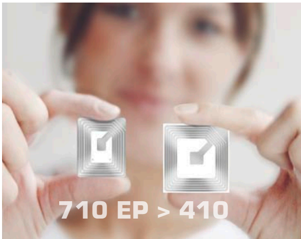
The 710 EP label outperforms standard 410 labels by 25 percent

EP labels deliver industry-changing advantages: